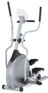
X1500 ELLIPTICAL TRAINER

The X1500 is our entry-level elliptical trainer but is still loaded with great features. It uses an ECB magnetic resistance system with a 21-lb. flywheel and a supersilent Quiet-Glide™ drive to create a durable machine that offers smooth resistance changes. The pivoting footplates, three-inch pedal spacing, and 18-inch stride length provide a comfortable and ergonomic stride motion. This model also comes standard with contact heart rate and heavy gauge construction.