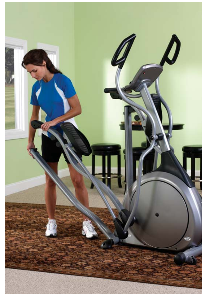
The X6200 can be folded to save space