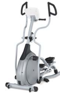
X6200 ELLIPTICAL TRAINER

The X6000 offers all of the benefits of the X1500 but in a larger and even more stable frame design. The larger frame and longer pedal arms allow us to offer an elongated elliptical motion and longer 19.75-inch stride length. The larger 15" x 6.5" footplates provide users with a roomy, stable base.