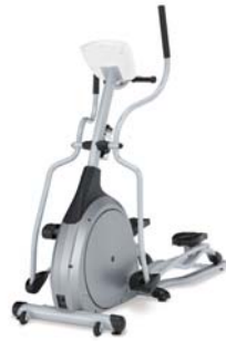
X6000 ELLIPTICAL TRAINER

The X1500 is our entry-level elliptical trainer but is still loaded with great features. It uses an ECB magnetic resistance system with a 21-lb. flywheel and a supersilent Quiet-Glide™ drive to create a durable machine that offers smooth resistance changes. The pivoting footplates, three-inch pedal spacing, and 18-inch stride length provide a comfortable and ergonomic stride motion. This model also comes standard with contact heart rate and heavy gauge construction.