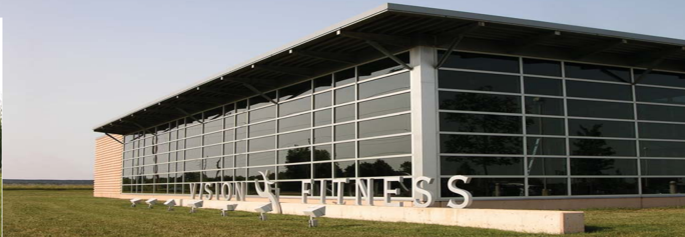
VISION FITNESS headquarters located in Lake Mills, WI